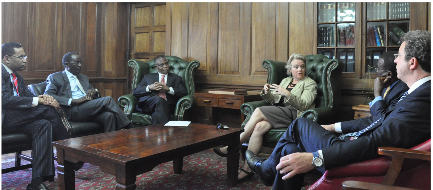
Wayamo Director in discussion with IOCD stakeholders in February 2013.