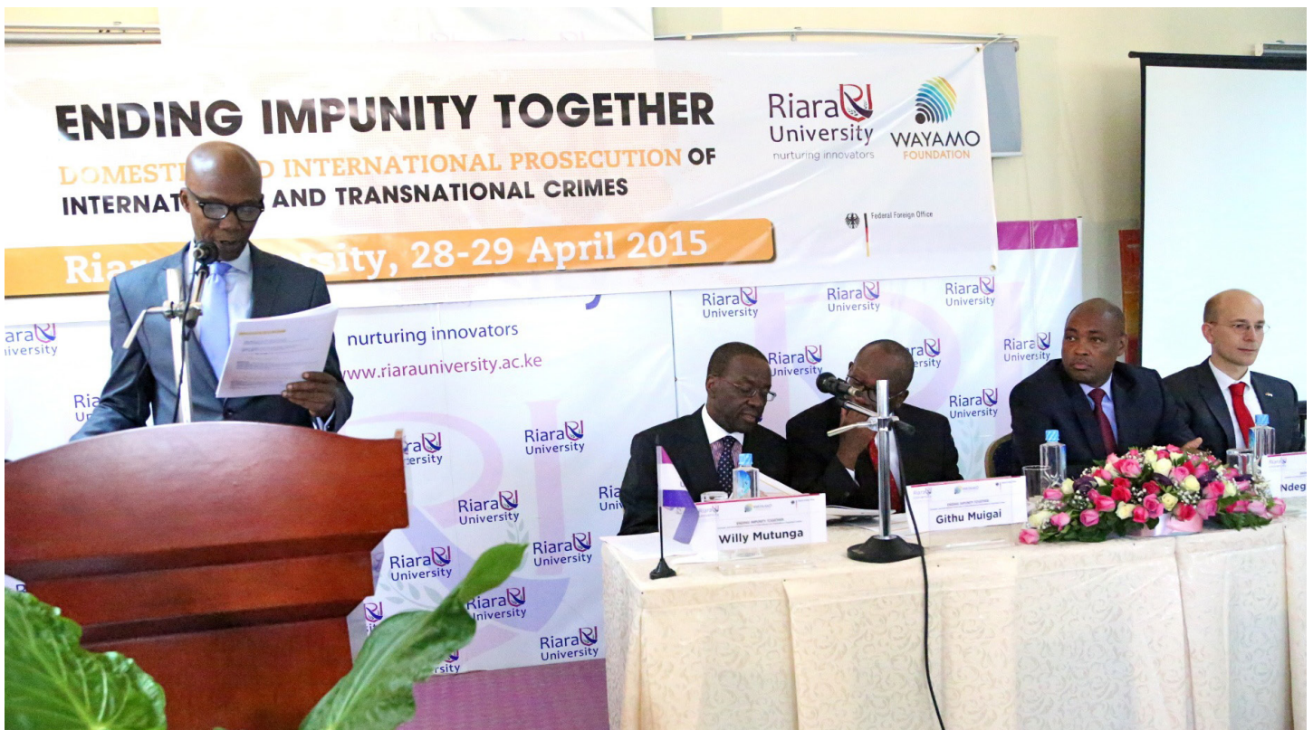
Wayamo symposium with all International and Organised Crimes Division stake-holders in April 2015 in Nairobi.