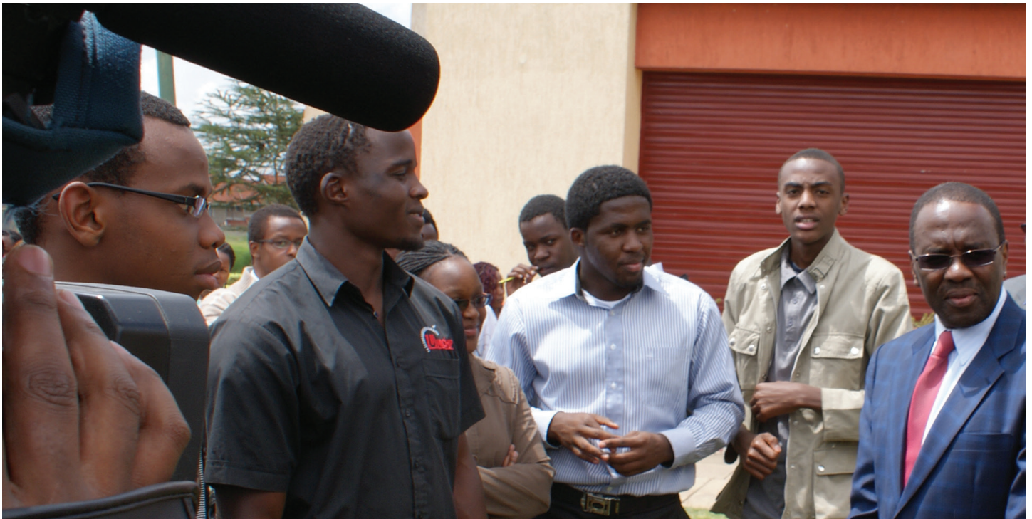
Chief Justice Willy Mutunga is interviewed after announcing the launch of the IOCD in November 2012.