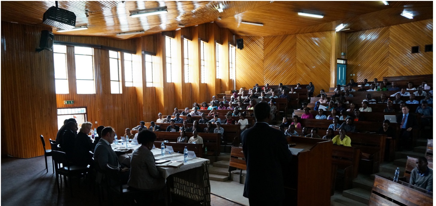
May 2014 University of Nairobi panel debate on supporting complementarity through domestic justice.