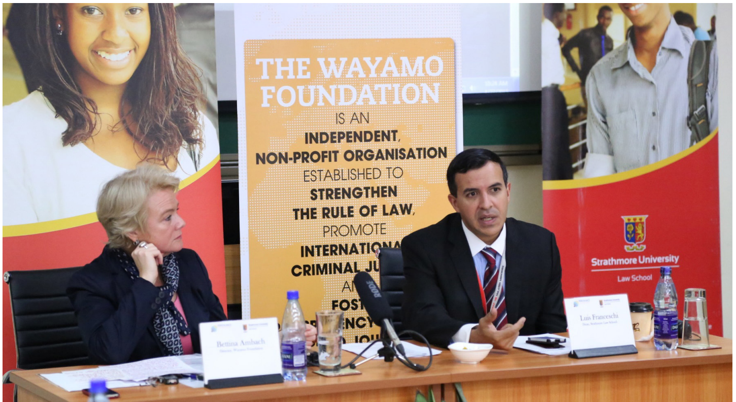
April 2015 workshop on the compendium of best practices in investigation and prosecution of international crimes.