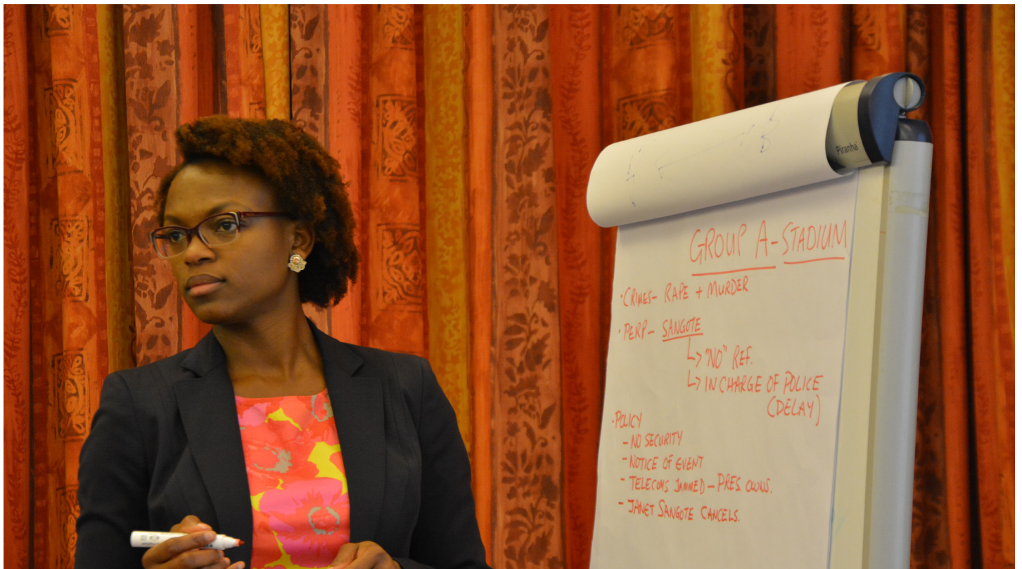
Workshop on Investigation and Prosecution of Crimes against Humanity under the International Crimes Act.