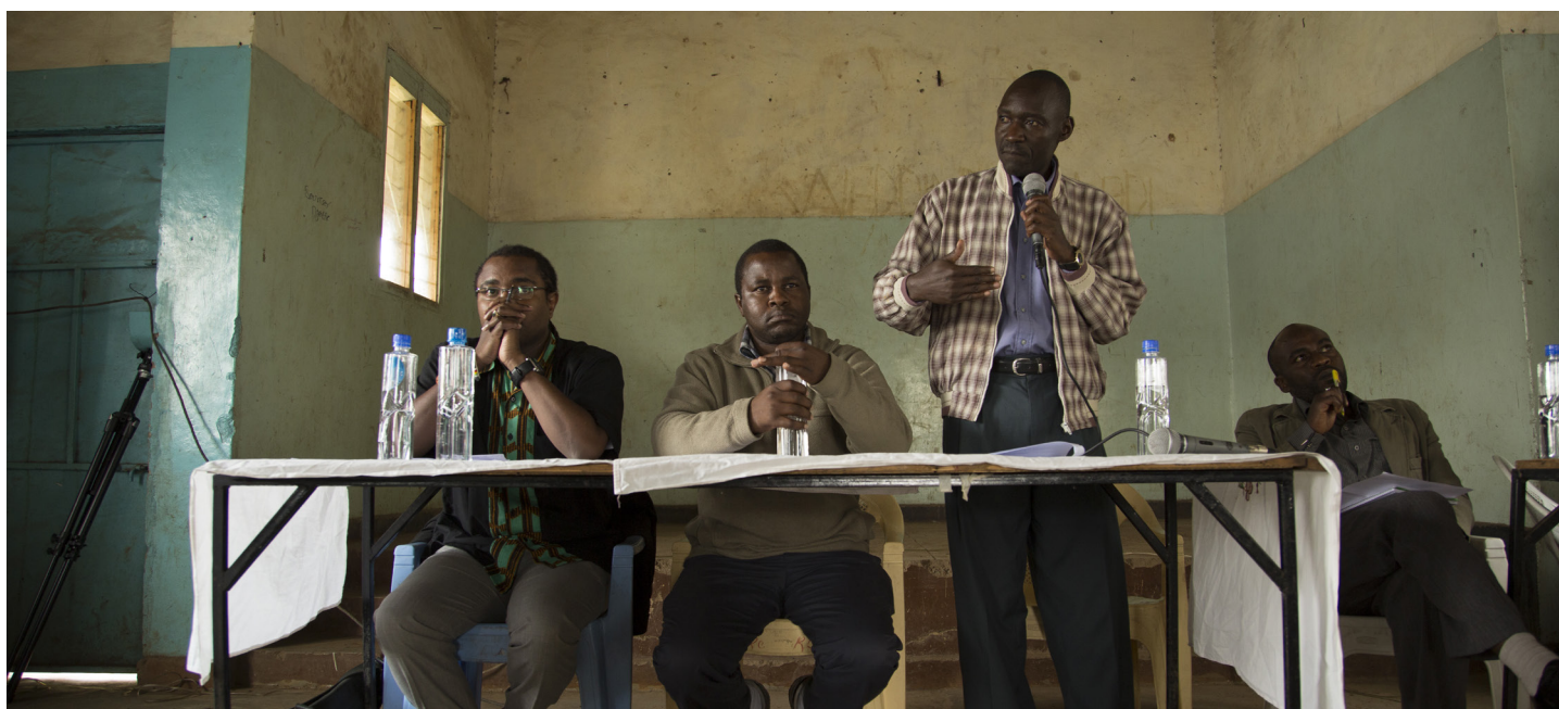
February 2014 community forum in Korogocho slum in Nairobi.